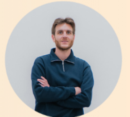
VanWeis Leathercraftsman Style & 3d Print