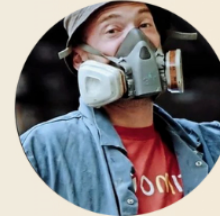
Stick Graffiti Artist Graffiti